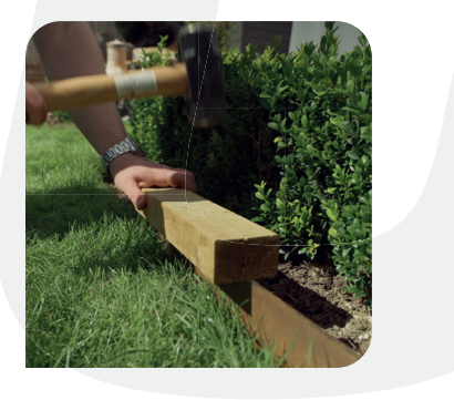
Using your block of wood and lump hammer, tap the edging into the ground to your desired height.