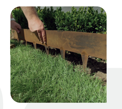
Set up a string line at the desired finish height for the top of the edging and install your first length.