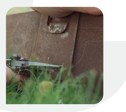
Complete the Dual Lock Mechanism® by bending back the folding tabs with your pliers.