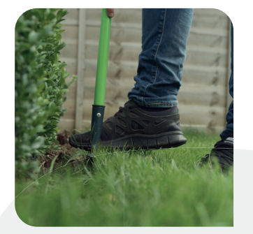
Use a lawn edging knife or shovel to prepare the edges of your lawn.