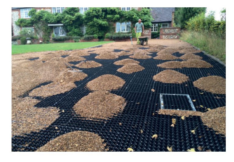
PRACTICAL | REMOVED EXISTING TARMAC, REPAIRED SOLUTION SUBBASE, LAID CORE DRIVE 60-40 HDR

The existing macadam surface was removed and a new granite set edge was installed. The existing sub base was topped up with additional type 1 sub base, graded shaped and re compacted. CORE DRIVE 60-40HDR gravel stabiliser was laid over a sharp sand blinding and galvanised steel fixing pins were inserted into the sockets to provide additional stability to the entire surface. It was then filled with locally sourced 10/12mm angular gravel.